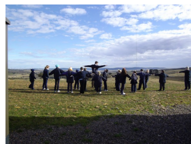
Our tour guide Frank.