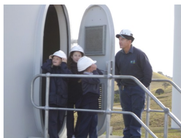
Safety comes first.