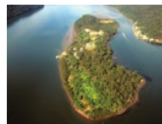
An aerial view of Milson Island