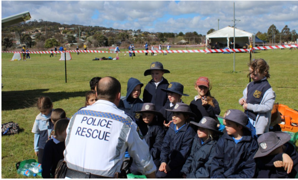
Who is checking out who ?? ↓