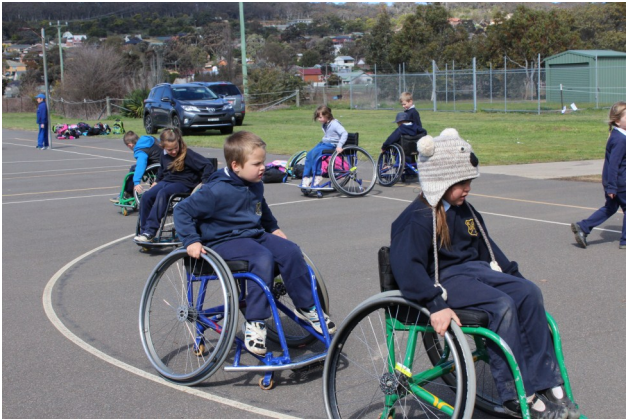
← What brave little Infants children we have !!