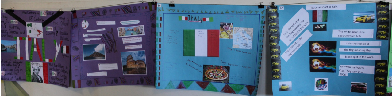
Some of the amazing posters on display.