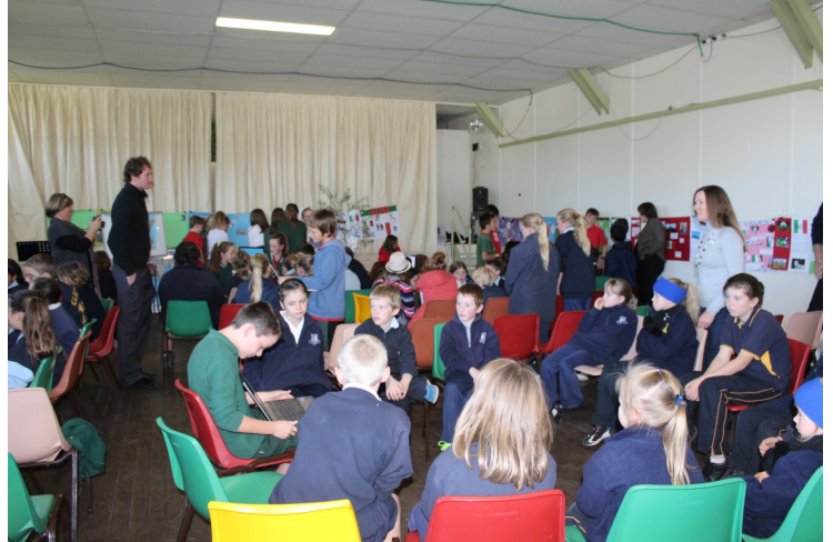
Below- all the children who attended the CWA International Day. Above- students working together in smaller groups with the visiting students from Canberra. Below- A merry sing-a-long !!