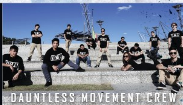
DAUNTLESS MOVEMENT CREW