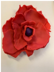
↑ Poppy's made by the K-2 class.