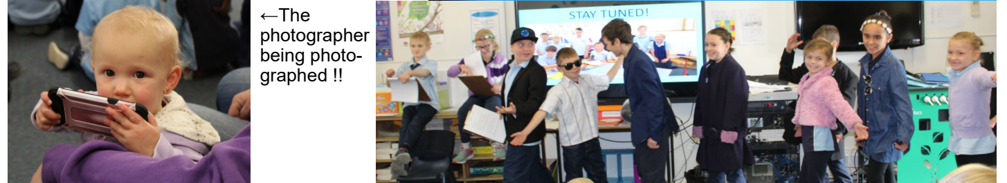
←The photographer being photographed !!