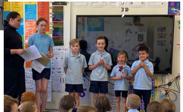
Birthday Certificates and Library Award winners ↓