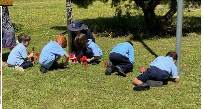
Remembrance Day Ceremony and our field of Poppies