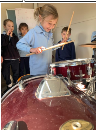
↑Some of our keen drummers ↓