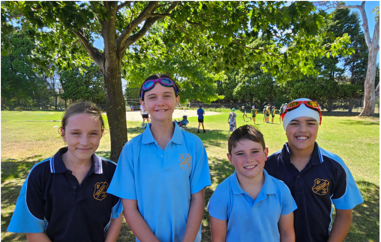
Tarago Public School State Swim Team

(02) 4849 4418 | tarago-p.school@det.nsw.edu.au